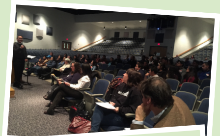
The Harrisonburg Chapter held an information session and know-your-rights training for immigrants in partnership with several other groups.