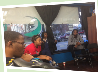
Emerging leaders in Richmond gathered for the second "barber shop talk" to discuss issues important to young people of color in the city and surrounding areas.