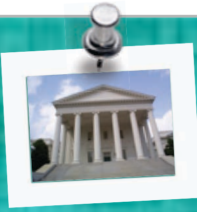
Virginia Organizing leaders from all over the state will visit the capitol for grassroots lobby days throughout the 2011 session.