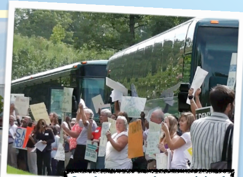
Leaders across the state joined our direct action at the Grassroots Gathering on August 11.