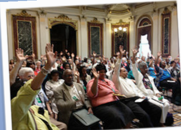
Virginia Organizing leaders attended a special policy briefing at the White House on July 13.