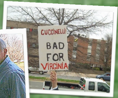
“Speak for yourself Mr. Cuccinelli!”