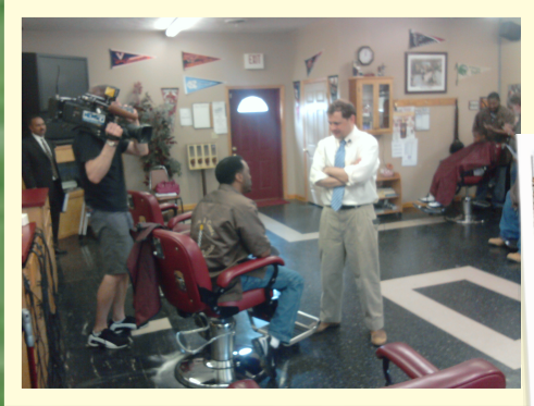
VOP held a barber shop conversation on the health care bill with Congressman Tom Perriello in Martinsville