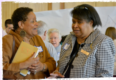
Virginia Organizing's 2013 Power Analysis was held on April 27 at Massenetta Springs. Participants learned about community organizing in other parts of the country and participated in two afternoon group learning activities of their choice.