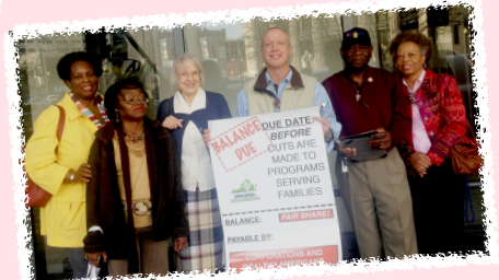
Leaders in Norfolk paid a visit to U.S. Senator Mark Warner's office to urge him to protect programs that support families and ask big corporations and wealthy Americans to pay their fair share.