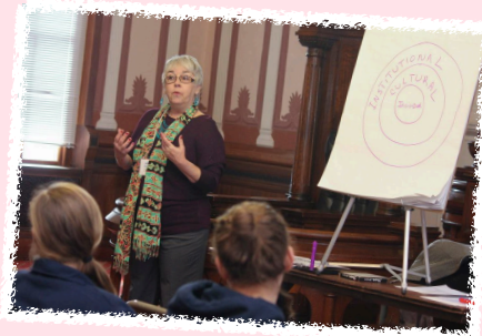
Virginia Organizing facilitated a Dismantling Racism workshop in Southwest Virginia on Martin Luther King, Jr. Day. Seventy-five students attended the workshop at Emory & Henry.