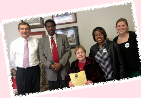
Virginia Organizing leaders from the Shenandoah Valley Chapters pose for a photo with Virginia Senator Emmett Hanger during their visit to the Capitol to ask legislators not to delay on Medicaid