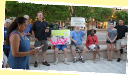
In South Hampton Roads, leaders gather for an interfaith prayer service called “Light the Way” to stand in solidarity with the immigrant community and share stories.