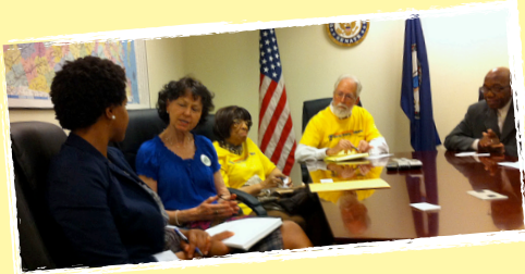
Virginia Organizing delivered letters, postcards, and petitions to the offices of U.S. Senators Mark Warner and Tim Kaine to support protecting and strengthening Social Security and oppose changing the cost of living calculation to the “chained-CPI.”