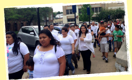
Harrisonburg leaders gathered and marched on May 19 in a prayer vigil with the Group of Harrisonburg Hispanic Pastors for comprehensive immigration reform.