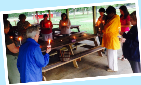
Leaders in Pennington Gap gathered for one of six Medicaid expansion vigils that Virginia Organizing led. The vigils were part of nine led by groups that support Medicaid expansion in Virginia.