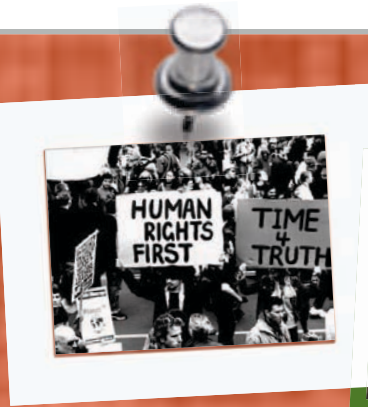
Virginia Organizing celebrated the Virginia Beach City Council adoption of the Human Rights Resolution to "....protect human rights of all in our community."