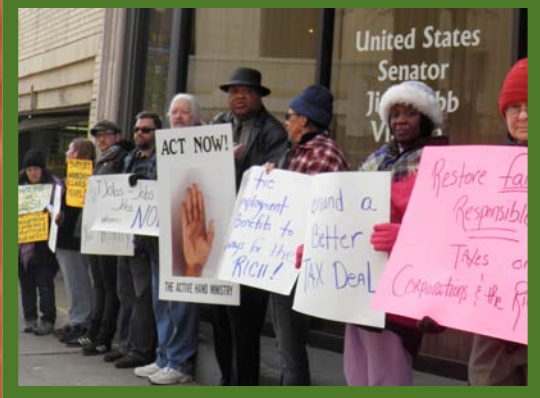
The Richmond Chapter protested renewing the Bush tax cuts for the wealthy outside of Senator Jim Webb's office.