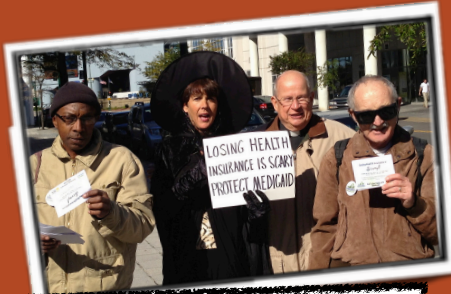
The South Hampton Roads Chapter held a demonstration outside of U.S. Senator Mark Warner's Norfolk office on Halloween to say, "Don't Play Tricks with Medicaid!" during budget negotiations in the lame duck session.