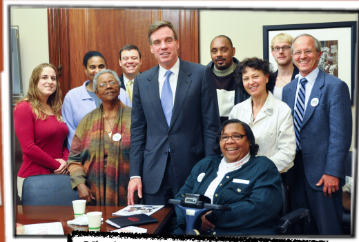
Virginia Organizing met with U.S. Senator Mark Warner on November 15 to discuss issues affecting Virginia communities.