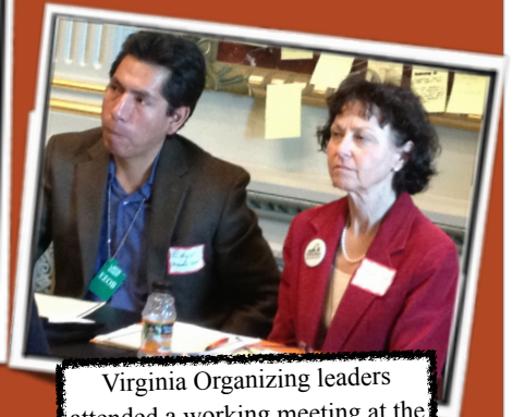
Virginia Organizing leaders attended a working meeting at the White House on tax fairness. Virginia Organizing sent 32 leaders to the White House on November 14.