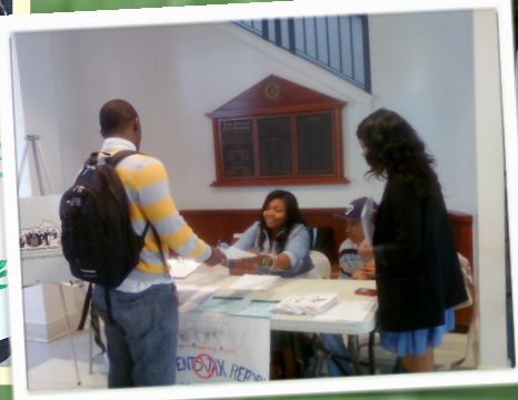
Virginia State University students highlight the impact the state budget has on higher education.