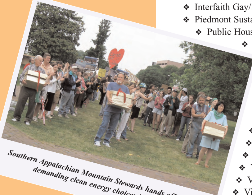
Southern Appalachian Mountain Stewards hands off petitions demanding clean energy choices in Virginia.