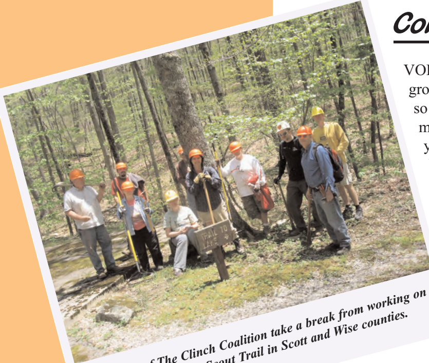
Members of The Clinch Coalition take a break from working on the Chief Benge Scout Trail in Scott and Wise counties.

VOP had a formal Joint Plan of Work with these groups in 2008, providing administrative support so they can spend their time and energy on their missions. To see their accomplishments this year, contact them directly or check out the VOP website.