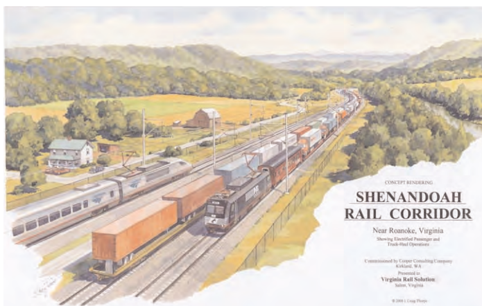
RAIL Solution works for a rail alternative to widening I-81.